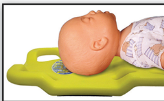
Patented Dual Plane Headrop System.