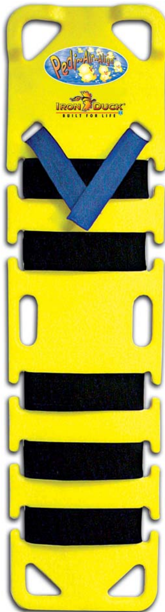
*Pedi~Air~Align Shown with Straps.